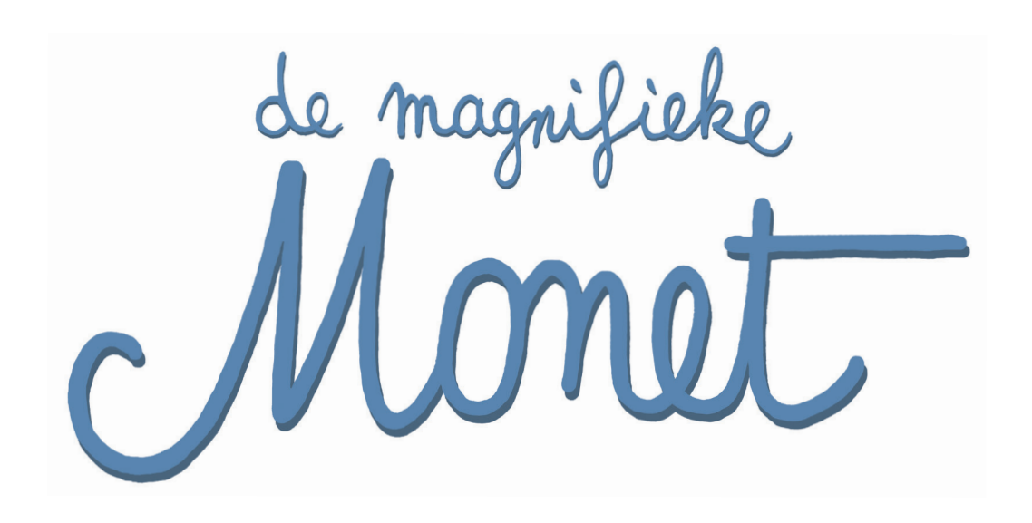
deel 1: Étretat